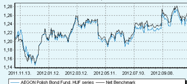
NET ASSET VALUE PER SHARE, 2011.11.01 - 2012.10.31

Past performance is no guarantee of future results. This report should not be considered as an offer or investment advisory. The Fund Prospectus contains the detailed conditions of the investment. The distribution costs of the fund purchase can be found at the distributors.