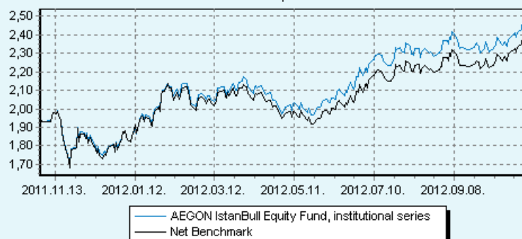
NET ASSET VALUE PER SHARE, 2011.11.01 - 2012.10.31

Past performance is no guarantee of future results. This report should not be considered as an offer or investment advisory. The Fund Prospectus contains the detailed conditions of the investment. The distribution costs of the fund purchase can be found at the distributors.