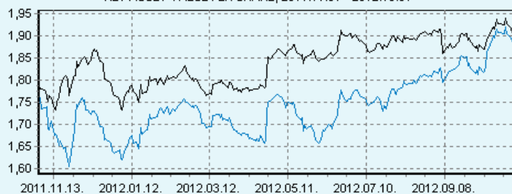
NET ASSET VALUE PER SHARE, 2011.11.01 - 2012.10.31

— AEGON Atticus Alfa Derivative Fund, PLN series — Net Benchmark