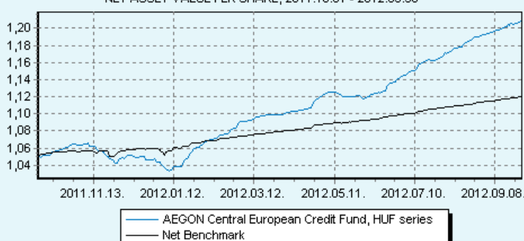
NET ASSET VALUE PER SHARE, 2011.10.01 - 2012.09.30

Past performance is no guarantee of future results. This report should not be considered as an offer or investment advisory. The Fund Prospectus contains the detailed conditions of the investment. The distribution costs of the fund purchase can be found at the distributors.