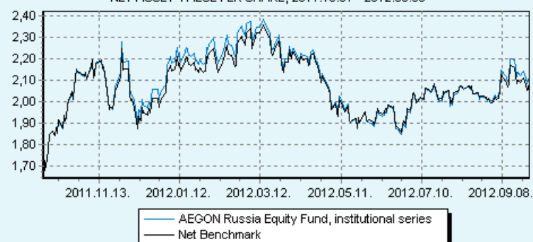
NET ASSET VALUE PER SHARE, 2011.10.01 - 2012.09.30

Past performance is no guarantee of future results. This report should not be considered as an offer or investment advisory. The Fund Prospectus contains the detailed conditions of the investment. The distribution costs of the fund purchase can be found at the distributors.