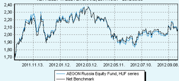
NET ASSET VALUE PER SHARE, 2011.10.01 - 2012.09.30

Past performance is no guarantee of future results. This report should not be considered as an offer or investment advisory. The Fund Prospectus contains the detailed conditions of the investment. The distribution costs of the fund purchase can be found at the distributors.