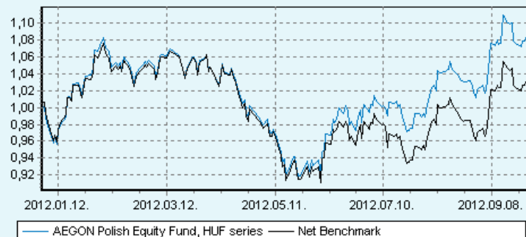
NET ASSET VALUE PER SHARE, 2012.01.03 - 2012.09.30

Past performance is no guarantee of future results. This report should not be considered as an offer or investment advisory. The Fund Prospectus contains the detailed conditions of the investment. The distribution costs of the fund purchase can be found at the distributors.