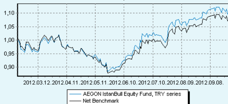
NET ASSET VALUE PER SHARE, 2012.02.20 - 2012.09.30

Past performance is no guarantee of future results. This report should not be considered as an offer or investment advisory. The Fund Prospectus contains the detailed conditions of the investment. The distribution costs of the fund purchase can be found at the distributors.