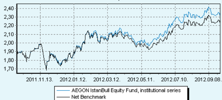
NET ASSET VALUE PER SHARE, 2011.10.01 - 2012.09.30

Past performance is no guarantee of future results. This report should not be considered as an offer or investment advisory. The Fund Prospectus contains the detailed conditions of the investment. The distribution costs of the fund purchase can be found at the distributors.