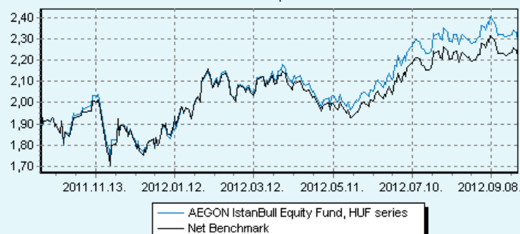
NET ASSET VALUE PER SHARE, 2011.10.01 - 2012.09.30

Past performance is no guarantee of future results. This report should not be considered as an offer or investment advisory. The Fund Prospectus contains the detailed conditions of the investment. The distribution costs of the fund purchase can be found at the distributors.