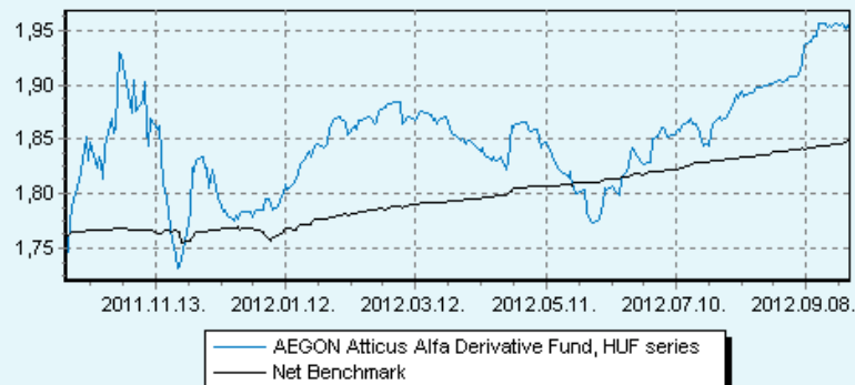
NET ASSET VALUE PER SHARE, 2011.10.01 - 2012.09.30

Past performance is no guarantee of future results. This report should not be considered as an offer or investment advisory. The Fund Prospectus contains the detailed conditions of the investment. The distribution costs of the fund purchase can be found at the distributors.