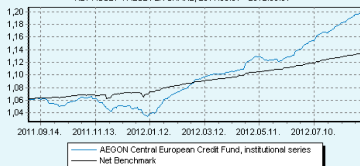
NET ASSET VALUE PER SHARE, 2011.09.01 - 2012.08.31

Past performance is no guarantee of future results. This report should not be considered as an offer or investment advisory. The Fund Prospectus contains the detailed conditions of the investment. The distribution costs of the fund purchase can be found at the distributors.