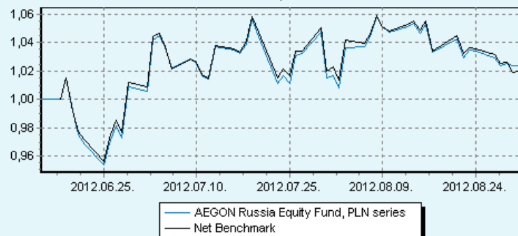
NET ASSET VALUE PER SHARE, 2011.09.01 - 2012.08.31

Past performance is no guarantee of future results. This report should not be considered as an offer or investment advisory. The Fund Prospectus contains the detailed conditions of the investment. The distribution costs of the fund purchase can be found at the distributors.