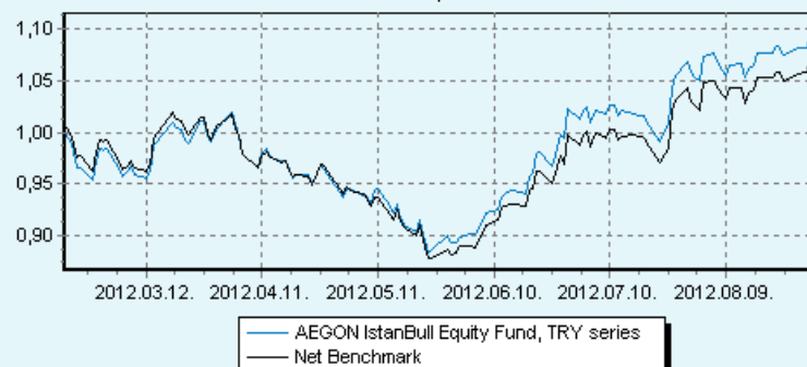
NET ASSET VALUE PER SHARE, 2011.09.01 - 2012.08.31

Past performance is no guarantee of future results. This report should not be considered as an offer or investment advisory. The Fund Prospectus contains the detailed conditions of the investment. The distribution costs of the fund purchase can be found at the distributors.