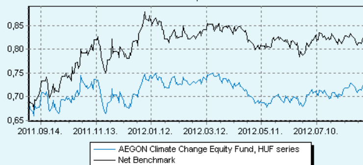
NET ASSET VALUE PER SHARE, 2011.09.01 - 2012.08.31

Past performance is no guarantee of future results. This report should not be considered as an offer or investment advisory. The Fund Prospectus contains the detailed conditions of the investment. The distribution costs of the fund purchase can be found at the distributors.