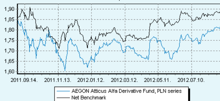
NET ASSET VALUE PER SHARE, 2011.09.01 - 2012.08.31

Past performance is no guarantee of future results. This report should not be considered as an offer or investment advisory. The Fund Prospectus contains the detailed conditions of the investment. The distribution costs of the fund purchase can be found at the distributors.