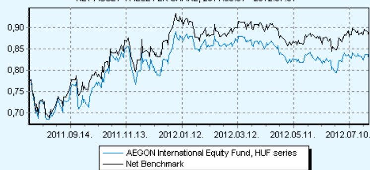
NET ASSET VALUE PER SHARE, 2011.08.01 - 2012.07.31

Past performance is no guarantee of future results. This report should not be considered as an offer or investment advisory. The Fund Prospectus contains the detailed conditions of the investment. The distribution costs of the fund purchase can be found at the distributors.