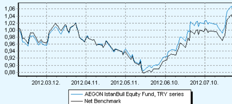
NET ASSET VALUE PER SHARE, 2011.08.01 - 2012.07.31

Past performance is no guarantee of future results. This report should not be considered as an offer or investment advisory. The Fund Prospectus contains the detailed conditions of the investment. The distribution costs of the fund purchase can be found at the distributors.