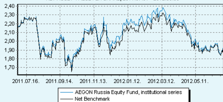
NET ASSET VALUE PER SHARE, 2011.07.01 - 2012.06.30

Past performance is no guarantee of future results. This report should not be considered as an offer or investment advisory. The Fund Prospectus contains the detailed conditions of the investment. The distribution costs of the fund purchase can be found at the distributors.