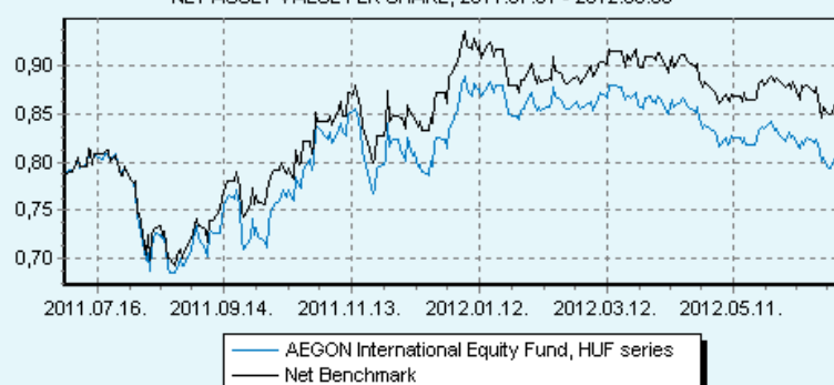
NET ASSET VALUE PER SHARE, 2011.07.01 - 2012.06.30

Past performance is no guarantee of future results. This report should not be considered as an offer or investment advisory. The Fund Prospectus contains the detailed conditions of the investment. The distribution costs of the fund purchase can be found at the distributors.