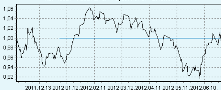
NET ASSET VALUE PER SHARE, 2011.07.01 - 2012.06.30

Past performance is no guarantee of future results. This report should not be considered as an offer or investment advisory. The Fund Prospectus contains the detailed conditions of the investment. The distribution costs of the fund purchase can be found at the distributors.