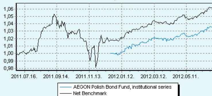
NET ASSET VALUE PER SHARE, 2011.07.01 - 2012.06.30

Past performance is no guarantee of future results. This report should not be considered as an offer or investment advisory. The Fund Prospectus contains the detailed conditions of the investment. The distribution costs of the fund purchase can be found at the distributors.