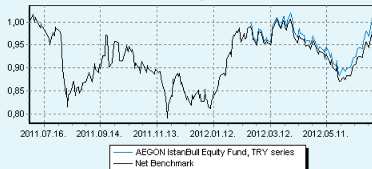
NET ASSET VALUE PER SHARE, 2011.07.01 - 2012.06.30

Past performance is no guarantee of future results. This report should not be considered as an offer or investment advisory. The Fund Prospectus contains the detailed conditions of the investment. The distribution costs of the fund purchase can be found at the distributors.