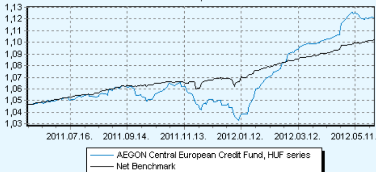
NET ASSET VALUE PER SHARE, 2011.06.01 - 2012.05.31

Past performance is no guarantee of future results. This report should not be considered as an offer or investment advisory. The Fund Prospectus contains the detailed conditions of the investment. The distribution costs of the fund purchase can be found at the distributors.