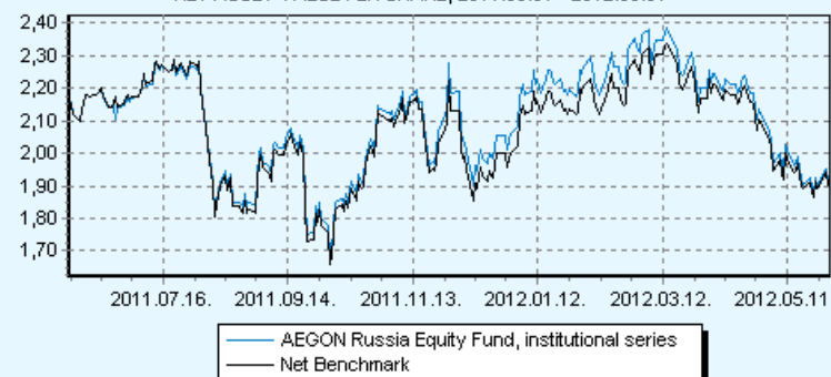
NET ASSET VALUE PER SHARE, 2011.06.01 - 2012.05.31

Past performance is no guarantee of future results. This report should not be considered as an offer or investment advisory. The Fund Prospectus contains the detailed conditions of the investment. The distribution costs of the fund purchase can be found at the distributors.