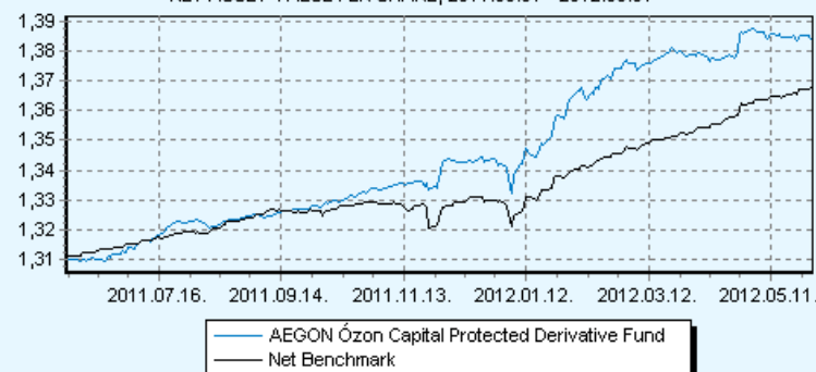
NET ASSET VALUE PER SHARE, 2011.06.01 - 2012.05.31

Past performance is no guarantee of future results. This report should not be considered as an offer or investment advisory. The Fund Prospectus contains the detailed conditions of the investment. The distribution costs of the fund purchase can be found at the distributors.