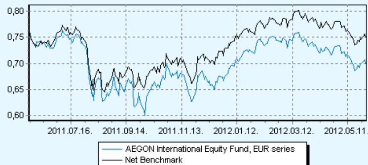
NET ASSET VALUE PER SHARE, 2011.06.01 - 2012.05.31

Past performance is no guarantee of future results. This report should not be considered as an offer or investment advisory. The Fund Prospectus contains the detailed conditions of the investment. The distribution costs of the fund purchase can be found at the distributors.