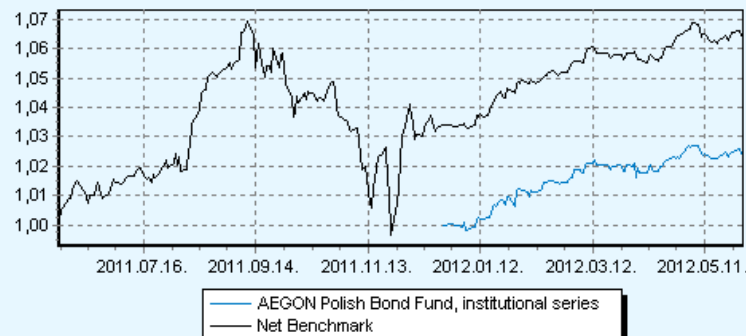
NET ASSET VALUE PER SHARE, 2011.06.01 - 2012.05.31

Past performance is no guarantee of future results. This report should not be considered as an offer or investment advisory. The Fund Prospectus contains the detailed conditions of the investment. The distribution costs of the fund purchase can be found at the distributors.