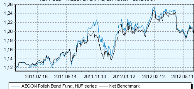
NET ASSET VALUE PER SHARE, 2011.06.01 - 2012.05.31

Past performance is no guarantee of future results. This report should not be considered as an offer or investment advisory. The Fund Prospectus contains the detailed conditions of the investment. The distribution costs of the fund purchase can be found at the distributors.