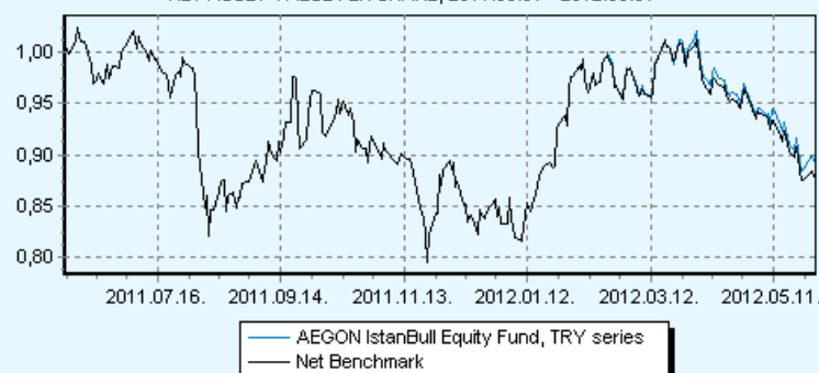
NET ASSET VALUE PER SHARE, 2011.06.01 - 2012.05.31

Past performance is no guarantee of future results. This report should not be considered as an offer or investment advisory. The Fund Prospectus contains the detailed conditions of the investment. The distribution costs of the fund purchase can be found at the distributors.