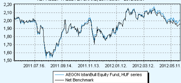
NET ASSET VALUE PER SHARE, 2011.06.01 - 2012.05.31

Past performance is no guarantee of future results. This report should not be considered as an offer or investment advisory. The Fund Prospectus contains the detailed conditions of the investment. The distribution costs of the fund purchase can be found at the distributors.