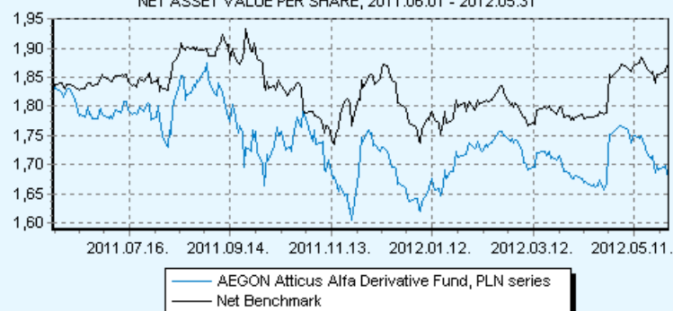
NET ASSET VALUE PER SHARE, 2011.06.01 - 2012.05.31

Past performance is no guarantee of future results. This report should not be considered as an offer or investment advisory. The Fund Prospectus contains the detailed conditions of the investment. The distribution costs of the fund purchase can be found at the distributors.