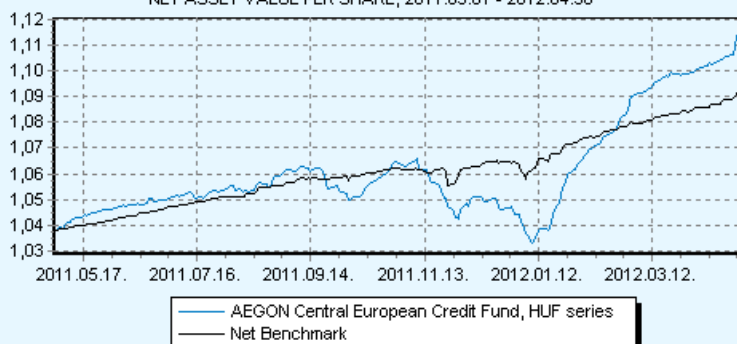
NET ASSET VALUE PER SHARE, 2011.05.01 - 2012.04.30

Past performance is no guarantee of future results. This report should not be considered as an offer or investment advisory. The Fund Prospectus contains the detailed conditions of the investment. The distribution costs of the fund purchase can be found at the distributors.