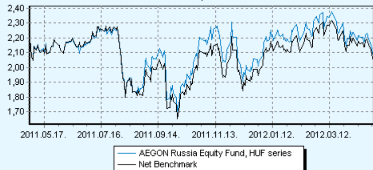
NET ASSET VALUE PER SHARE, 2011.05.01 - 2012.04.30

Past performance is no guarantee of future results. This report should not be considered as an offer or investment advisory. The Fund Prospectus contains the detailed conditions of the investment. The distribution costs of the fund purchase can be found at the distributors.