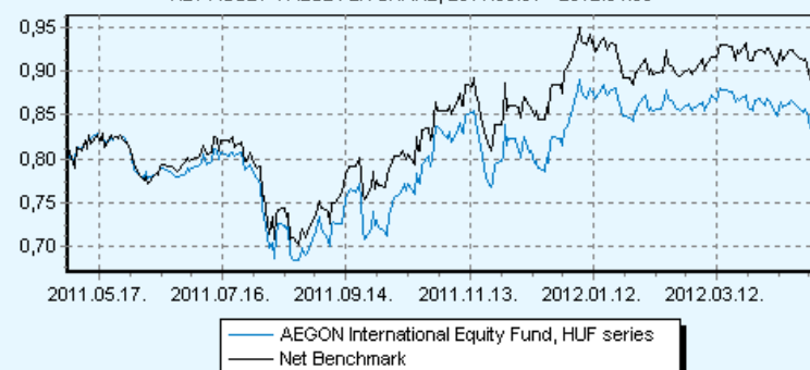
NET ASSET VALUE PER SHARE, 2011.05.01 - 2012.04.30

Past performance is no guarantee of future results. This report should not be considered as an offer or investment advisory. The Fund Prospectus contains the detailed conditions of the investment. The distribution costs of the fund purchase can be found at the distributors.