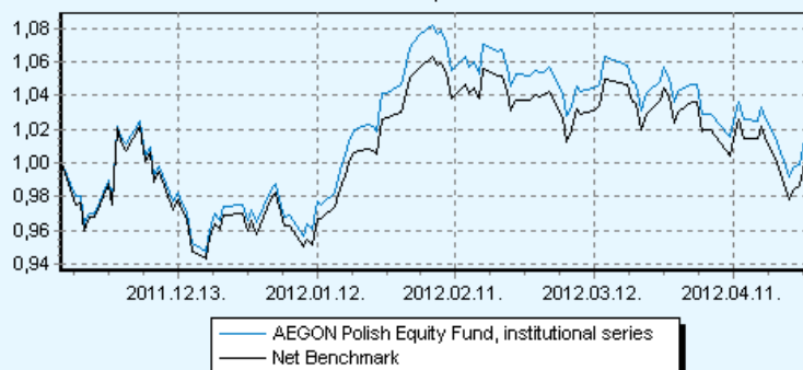
NET ASSET VALUE PER SHARE, 2011.05.01 - 2012.04.30

Past performance is no guarantee of future results. This report should not be considered as an offer or investment advisory. The Fund Prospectus contains the detailed conditions of the investment. The distribution costs of the fund purchase can be found at the distributors.