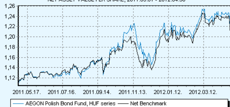
NET ASSET VALUE PER SHARE, 2011.05.01 - 2012.04.30

Past performance is no guarantee of future results. This report should not be considered as an offer or investment advisory. The Fund Prospectus contains the detailed conditions of the investment. The distribution costs of the fund purchase can be found at the distributors.