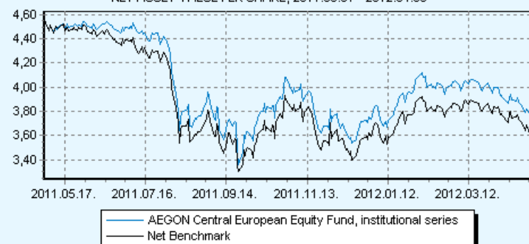
NET ASSET VALUE PER SHARE, 2011.05.01 - 2012.04.30

Past performance is no guarantee of future results. This report should not be considered as an offer or investment advisory. The Fund Prospectus contains the detailed conditions of the investment. The distribution costs of the fund purchase can be found at the distributors.