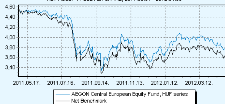
NET ASSET VALUE PER SHARE, 2011.05.01 - 2012.04.30

Past performance is no guarantee of future results. This report should not be considered as an offer or investment advisory. The Fund Prospectus contains the detailed conditions of the investment. The distribution costs of the fund purchase can be found at the distributors.