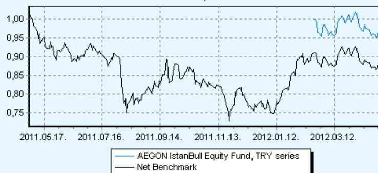
NET ASSET VALUE PER SHARE, 2011.05.01 - 2012.04.30

Past performance is no guarantee of future results. This report should not be considered as an offer or investment advisory. The Fund Prospectus contains the detailed conditions of the investment. The distribution costs of the fund purchase can be found at the distributors.