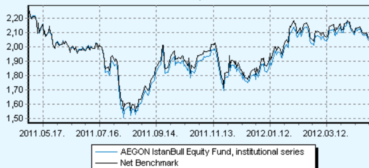
NET ASSET VALUE PER SHARE, 2011.05.01 - 2012.04.30

Past performance is no guarantee of future results. This report should not be considered as an offer or investment advisory. The Fund Prospectus contains the detailed conditions of the investment. The distribution costs of the fund purchase can be found at the distributors.