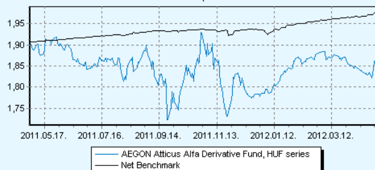
NET ASSET VALUE PER SHARE, 2011.05.01 - 2012.04.30

Past performance is no guarantee of future results. This report should not be considered as an offer or investment advisory. The Fund Prospectus contains the detailed conditions of the investment. The distribution costs of the fund purchase can be found at the distributors.