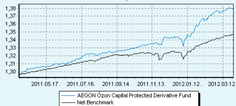
NET ASSET VALUE PER SHARE, 2011.04.01 - 2012.03.31

Past performance is no guarantee of future results. This report should not be considered as an offer or investment advisory. The Fund Prospectus contains the detailed conditions of the investment. The distribution costs of the fund purchase can be found at the distributors.