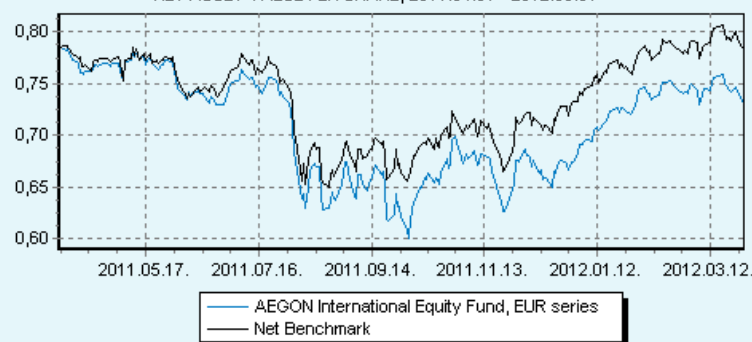
NET ASSET VALUE PER SHARE, 2011.04.01 - 2012.03.31

Past performance is no guarantee of future results. This report should not be considered as an offer or investment advisory. The Fund Prospectus contains the detailed conditions of the investment. The distribution costs of the fund purchase can be found at the distributors.