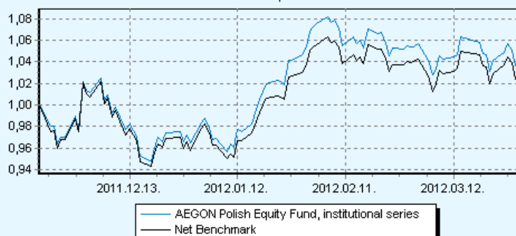
NET ASSET VALUE PER SHARE, 2011.04.01 - 2012.03.31

Past performance is no guarantee of future results. This report should not be considered as an offer or investment advisory. The Fund Prospectus contains the detailed conditions of the investment. The distribution costs of the fund purchase can be found at the distributors.