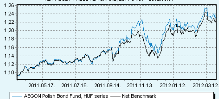
NET ASSET VALUE PER SHARE, 2011.04.01 - 2012.03.31

Past performance is no guarantee of future results. This report should not be considered as an offer or investment advisory. The Fund Prospectus contains the detailed conditions of the investment. The distribution costs of the fund purchase can be found at the distributors.