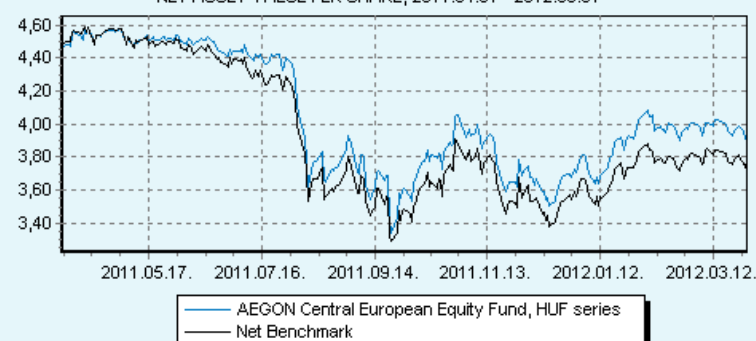
NET ASSET VALUE PER SHARE, 2011.04.01 - 2012.03.31

Past performance is no guarantee of future results. This report should not be considered as an offer or investment advisory. The Fund Prospectus contains the detailed conditions of the investment. The distribution costs of the fund purchase can be found at the distributors.