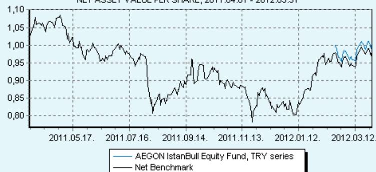
NET ASSET VALUE PER SHARE, 2011.04.01 - 2012.03.31

Past performance is no guarantee of future results. This report should not be considered as an offer or investment advisory. The Fund Prospectus contains the detailed conditions of the investment. The distribution costs of the fund purchase can be found at the distributors.