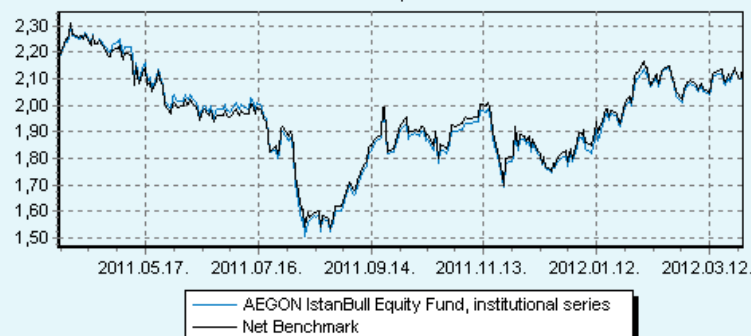
NET ASSET VALUE PER SHARE, 2011.04.01 - 2012.03.31

Past performance is no guarantee of future results. This report should not be considered as an offer or investment advisory. The Fund Prospectus contains the detailed conditions of the investment. The distribution costs of the fund purchase can be found at the distributors.