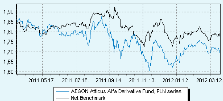
NET ASSET VALUE PER SHARE, 2011.04.01 - 2012.03.31

Past performance is no guarantee of future results. This report should not be considered as an offer or investment advisory. The Fund Prospectus contains the detailed conditions of the investment. The distribution costs of the fund purchase can be found at the distributors.